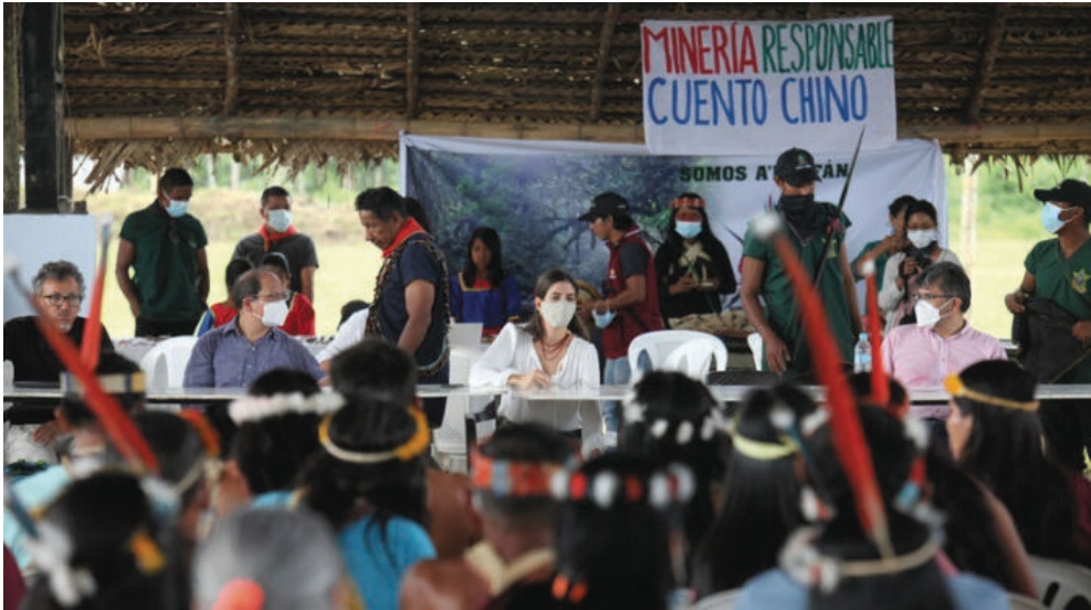
Figure 1 - On-site public hearing of the Constitutional Court in the Sinangoe indigenous community.

120